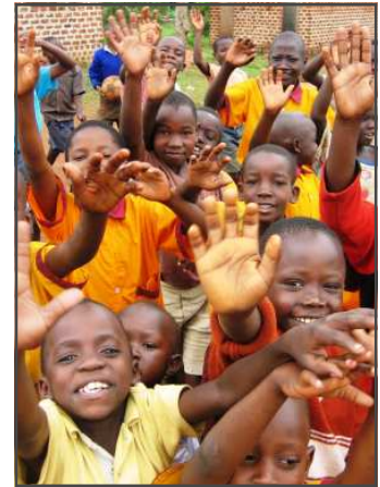
Children playing during recess at Christian Upliftment Primary School in Kampala, Uganda

In this face of such extreme need we sometimes forget to appreciate the many accomplishments of our organization and AYA's partners, who work tirelessly on behalf of children in their communities. Please join AYA as we celebrate 10 years and counting!