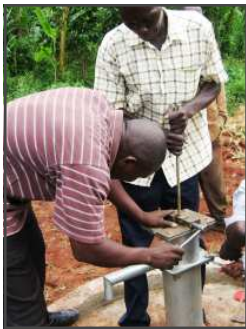
Men installing the finishing touches on a well at Rapha School in Jinja, Uganda

official opening of Gospel Believers' completed complex in Kitale. Local government officials and leaders were in attendance, the children performed traditional songs and dancing, and a huge feast was served as the community celebrated a new home and future for the children of Gospel Believers. Thanks to our supporters, Gospel Believers is one of AYA's success stories.