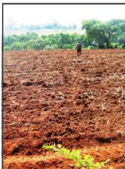
AYA's farmland in Kitale, Kenya.

in Uganda. It is estimated that 15,000 people will benefit from the clean water and education provided through this program. We look forward to sending updates on the progress of this three-year project.