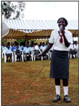
Girl singing at the opening celebration of Gospel Believers Children's Centre in Kitale, Kenya